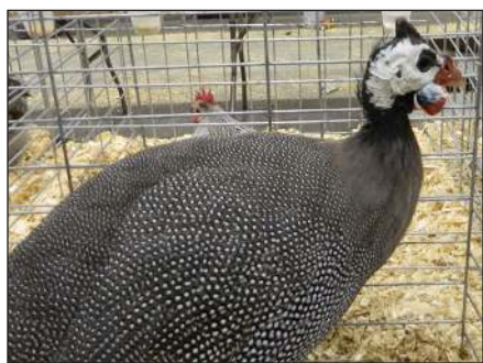
Figure 1. A pearl grey helmeted guinea hen. Jacquie Jacob

The remainder of this publication refers to raising the helmeted guinea fowl.